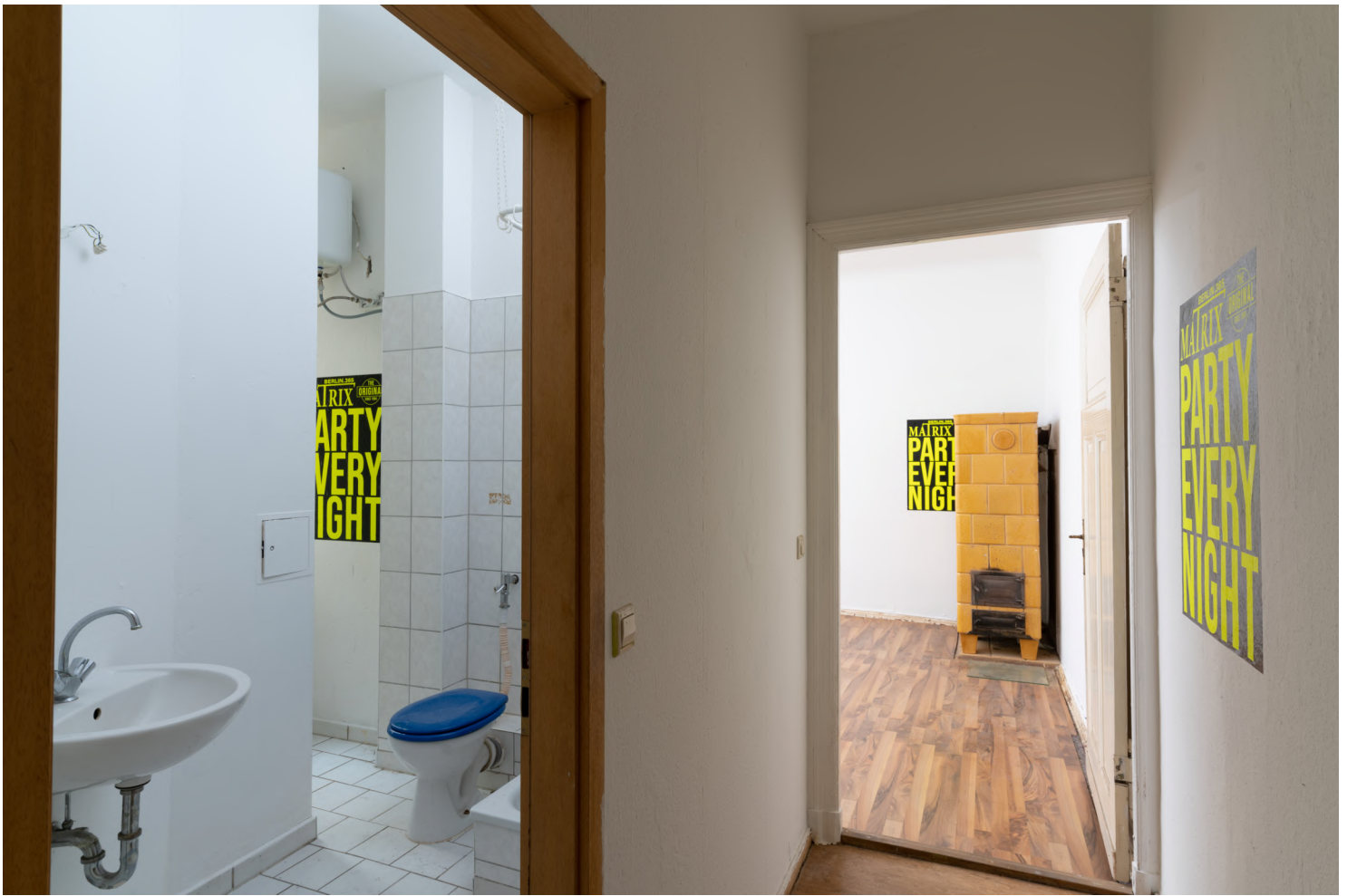
Installationview of a bathroom, hallway and livingroom with three posters. Left angle there is a white bathroom with white tiles and a blue toiletseat. Between the sink and toilet you read: ARTY, VERY, IGH