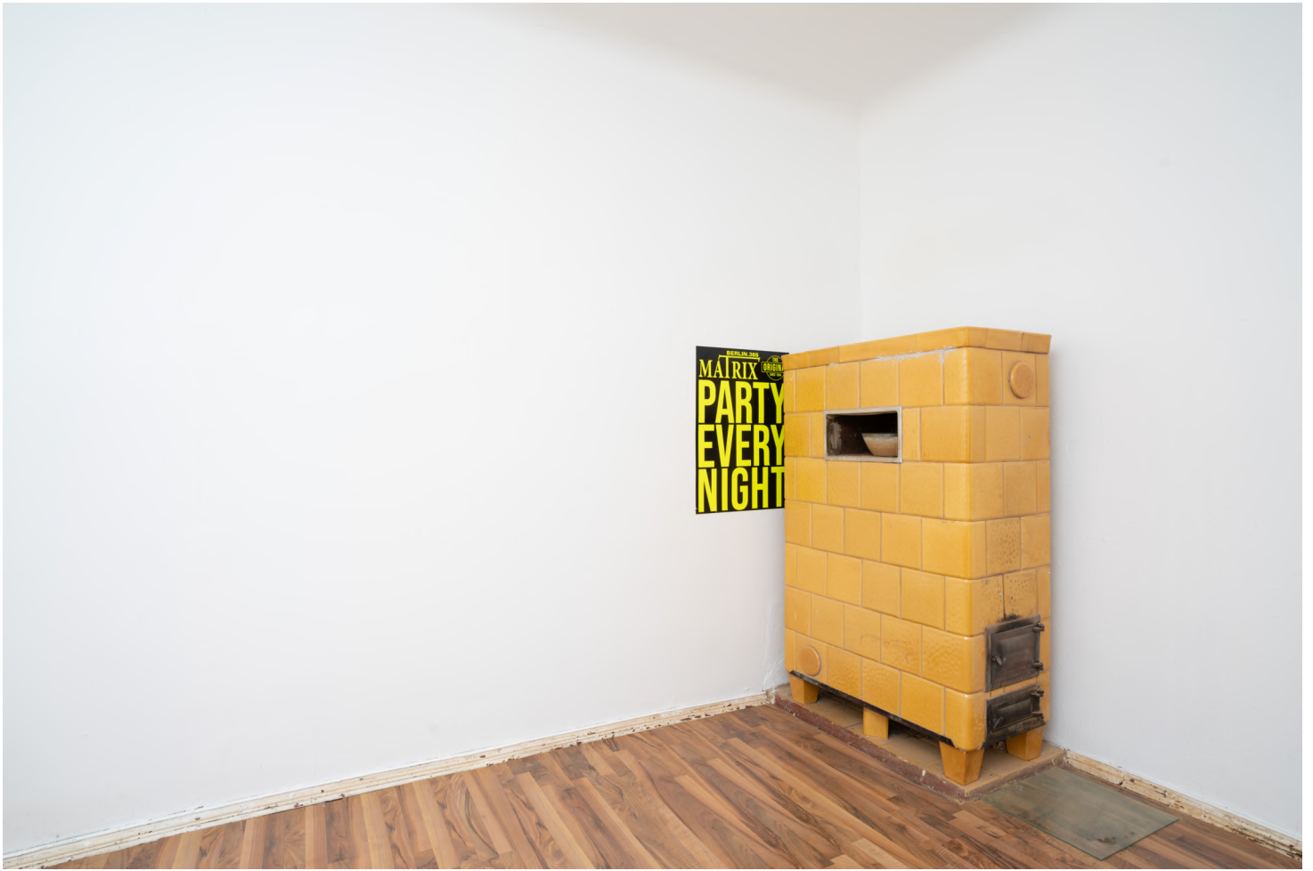
Installationview of one poster, hidden behind a lonely tiled stove. Right beside the stove on a PVC floor, which is framed by grimy wooden scuff ribs, lays a glass plate.