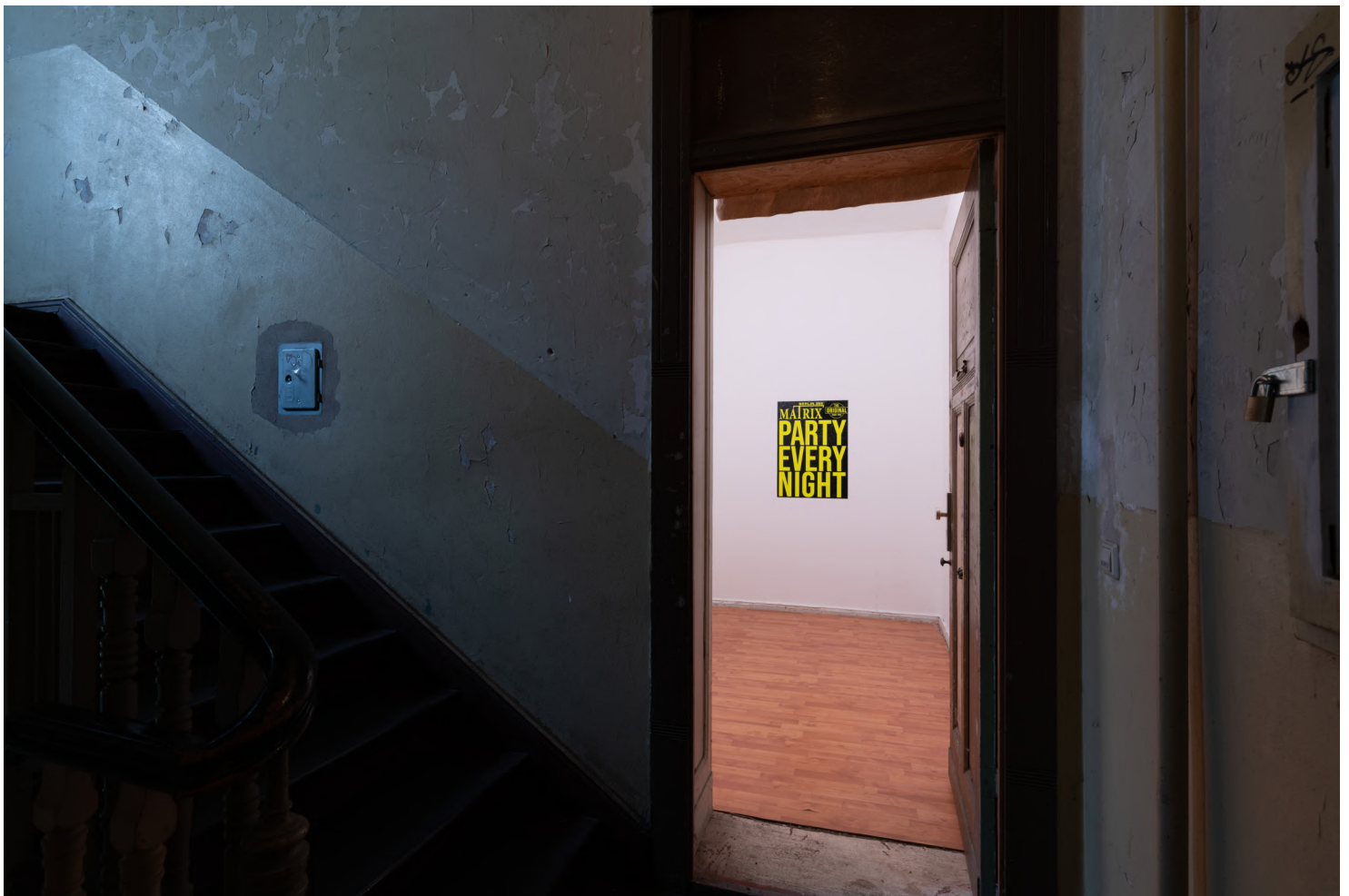
Installationview from a stairway with flaking walls, dim light and a door standing open. You are about to enter the flat focusing a white wall with a poster in the center. The PVC floor imitates a wood parquet.