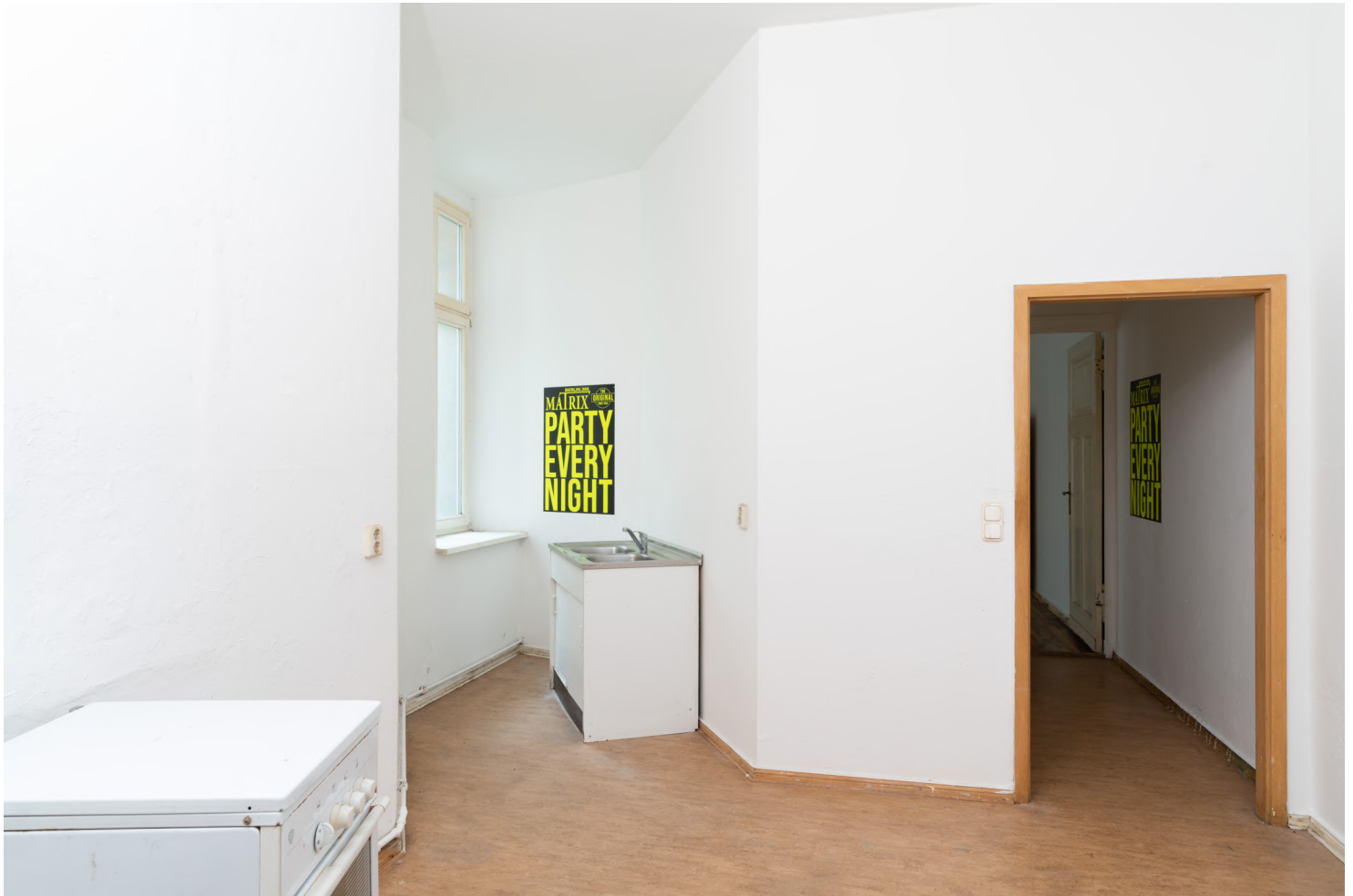
Installationview of a well-lit kitchen. On the left between a window and a sink, one poster is stuck directly to the wall. Another one, right hand, leads into a tight hallway towards a backroom. The floor has a different pattern PVC coating. (brown yelloish). In the Front a gas stove juts into the image.