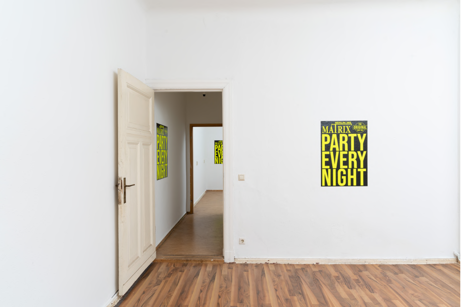
Installationview from the livingroom through the hallway into the kitchen with three posters hanging in the same hight.