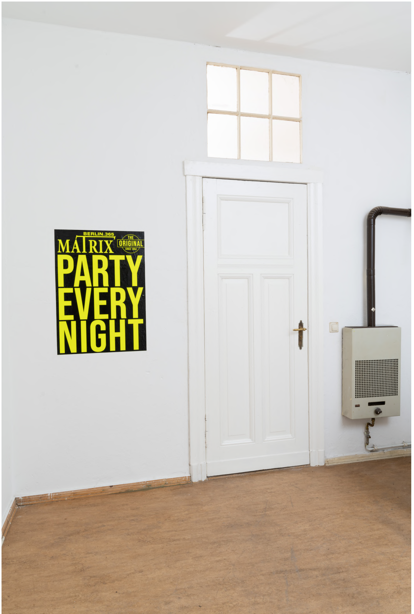
Installationview of a poster which is placed next to a white, wooden door, a bright window and a gas heating system. The pipe leads out of the composition ad infinitum. Again you see the indefinable cloudy pattern of the floor with wooden scuff ribs, which are left natural on the left side and painted on the right